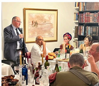
Professor Elyakim Rubenstein Former Att. General of Israel

I was reminded this week of how the times have changed from when I grew up there, when I saw hundreds of thousands of people standing at the borders, trying to escape the tragedy taking place in the Ukraine. They are standing in the cold in long lines for days and nights, and there was one word that every one of them wished they had written in their passport - the word "Jew". If it says "Jew" in your passport, you know there will be someone on the other side of the border who is looking for you; there are Jews out there who will take care of you when you get out; you have a place to go.